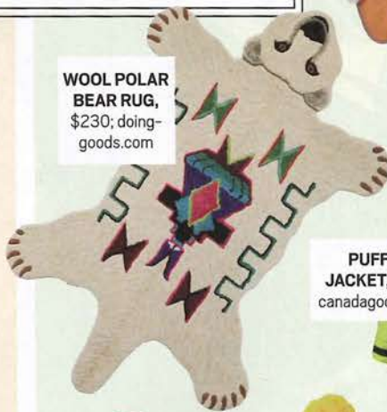
WOOL POLAR BEAR RUG , $230; doing-goods.com