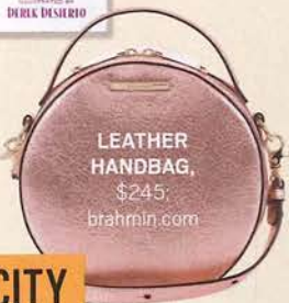
LEATHER HANDBAG , $245; brahmin.com