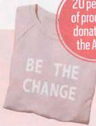
SWEATSHIRT , Amo, $178; amodenim.com