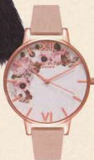
WATCH , $125; oliviaburton.com