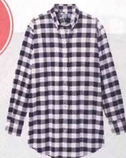
OVERSIZE FLANNEL SHIRT , Claridge + King, $145; claridgeandking.com