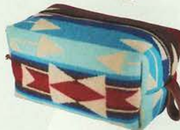
TOILETRIES BAG , $98; fritzandfraulein.com