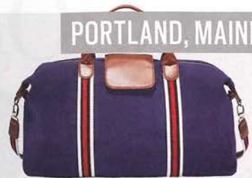
CANVAS AND VEGAN LEATHER DUFFEL , $50; broukandco.com