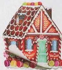
PAPER PLACEMATS , $29 for 12; hesterandcook.com