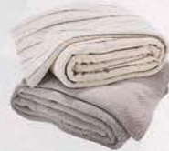
MADE-IN-MAINE COTTON BLANKETS , from $264 each; evangelinelines.com