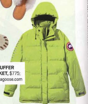
PUFFER JACKET , $775; canadagoose.com