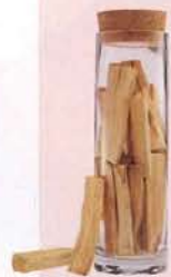
PALO SANTO WOOD INCENSE STICKS , $64; skeemshop.com