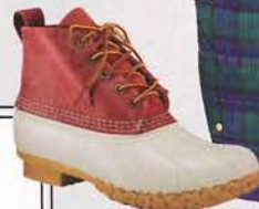
WATERPROOF BOOT , $125; llbean.com