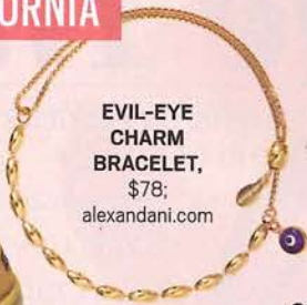
EVIL-EYE CHARM BRACELET , $78; alexandani.com