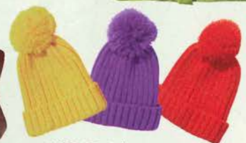
HATS , Em John, $22 each; emjohnjewelry.com