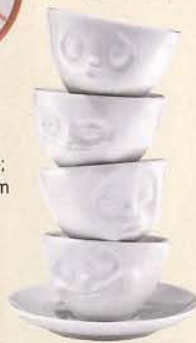
ESPRESSO FACE CUPS WITH SAUCERS , Fiftyeight Products, $13 per cup and saucer; 58products.com