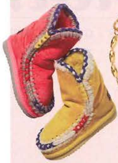
KIDS' SHEEPSKIN BOOTS , Mou, $250 per pair; mou-online.com