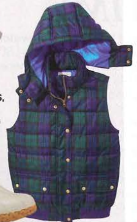
PUFFER VEST , Peyton & Parker, $50; jcpenny.com