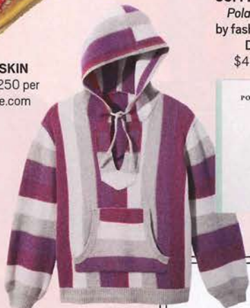
SWEATER PONCHO , Faherty, $298; fahertybrand.com