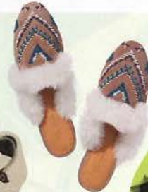
FAUX-FUR BEADED MULES , $159; soludos.com