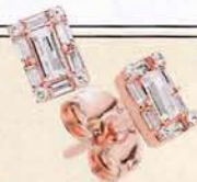
STUD EARRINGS , Pandora Jewelry, $75; pandora.net